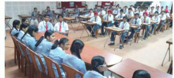
Fully AC Conference Hall with a seating capacity of 200 a perfect place for workshops, seminars and meetings.