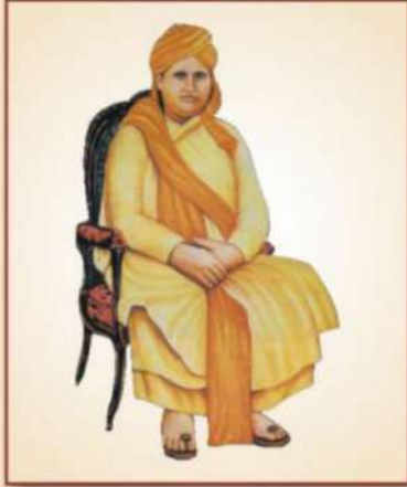
Swami Dayanand Saraswati 'The Divine Grace'