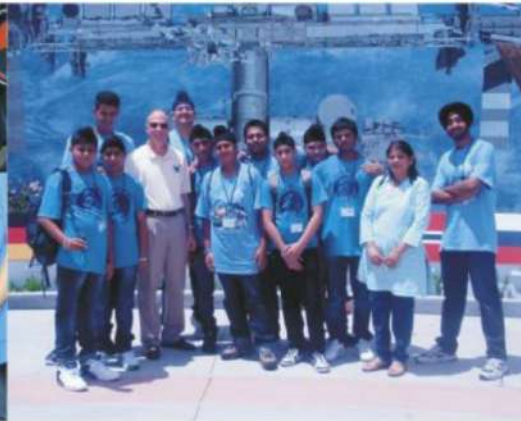
Students in Kennedy Space Center, NASA