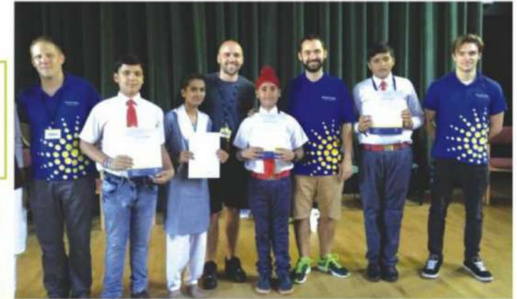
Students attending a fortnightly Summer School Programme at THAMES VALLEY EPSOM COLLEGE, UK