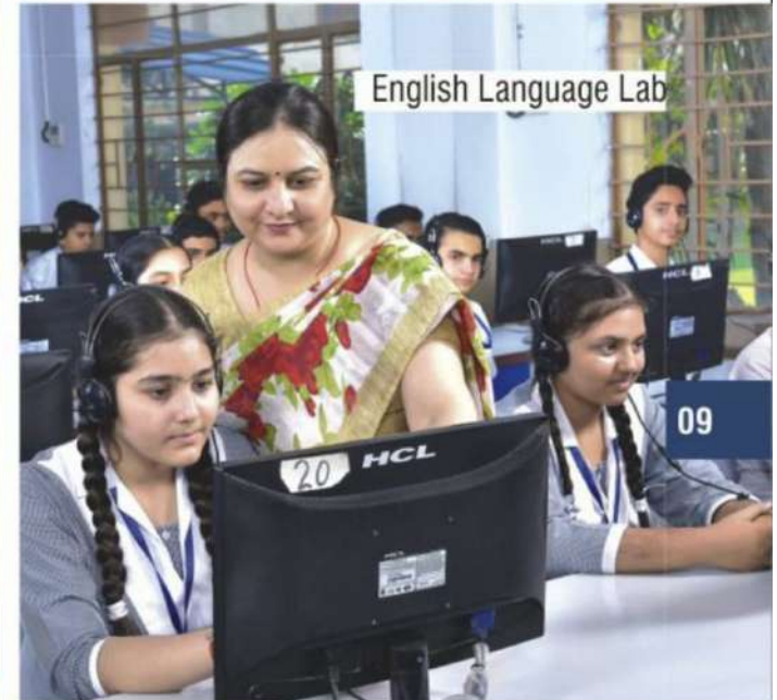
English Language Lab