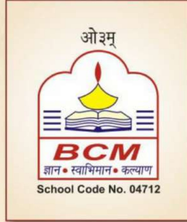
Symbolic Meaning of School Logo

Om, Four Vedas, the book and the lamp of light with the motto of "Gyan, Swabhiman and Kalyan" inscribed below the name of the school show the educational philosophy the school follows.