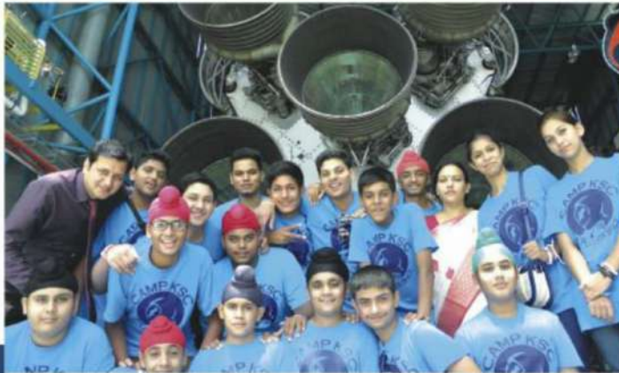
Students in Kennedy Space Center, NASA

BCM School provides its students with various learning opportunities through National & International Educational Tours. The reins of the World of Science & Technology would be in the hands of these leaders of tomorrow.