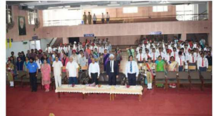
Multipurpose Auditorium with a seating capacity of 800 for all Intra & Inter School activities and ceremonious events.