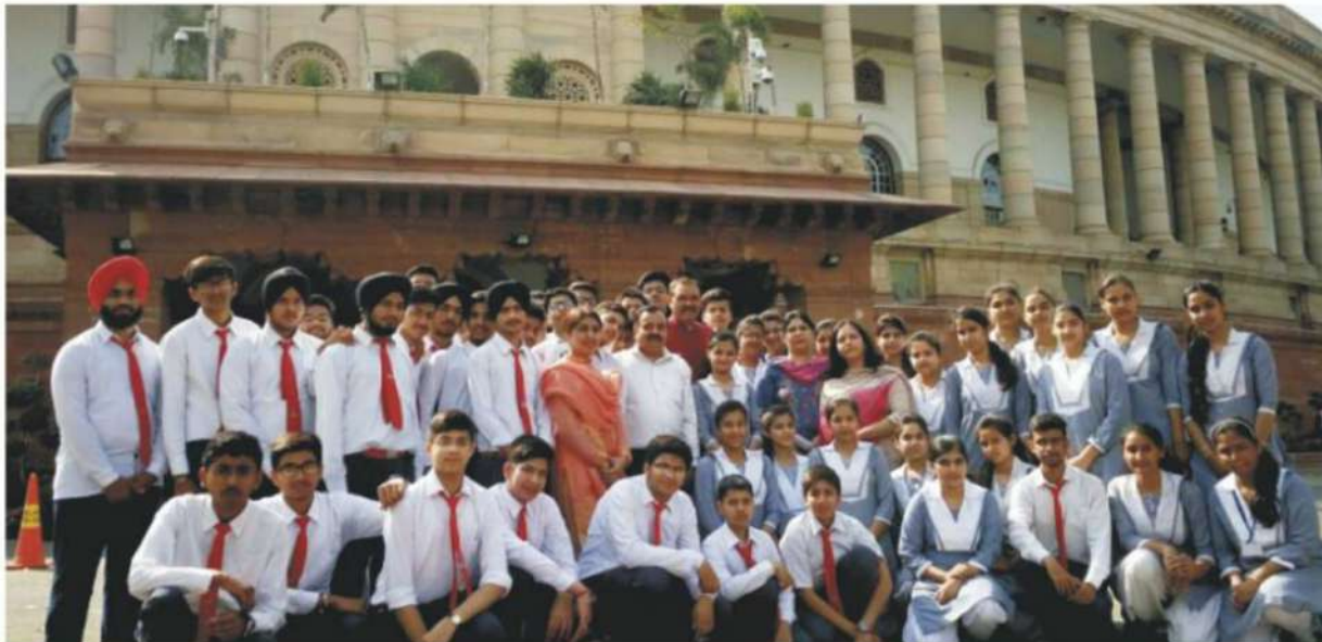
Students' visit to Parliament