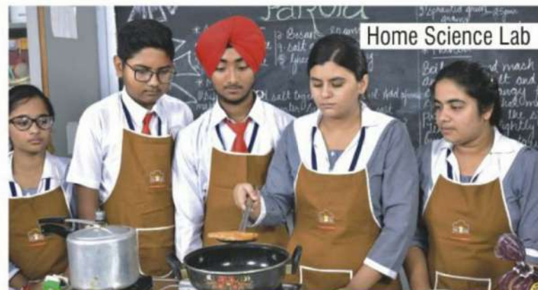
Home Science Lab