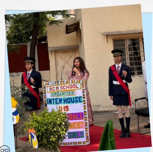
VICE PRINCIPAL'S ADDRESS