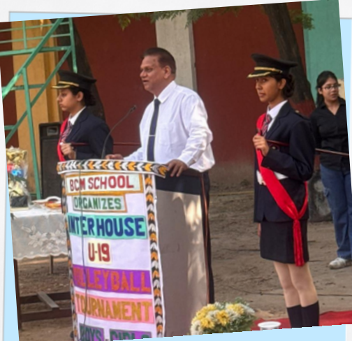
PRINCIPAL DECLARES THE TOURNAMENT OPEN