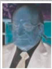
Mahatma Satyanand Munjal 24 May 1917- 14 April 2016