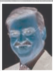
Sh. Sunil Kant Munjal