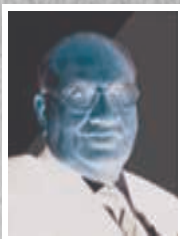
Sh. Brij Mohan Lall Munjal 1 July 1923 - 1 November 2015